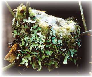
Rufous Hummingbird nest

Whether you're involved in managing public or private lands, large acreages or small areas, you can make them attractive to our native hummingbirds. Even long, narrow pieces of habitat, like utility corridors, field edges, and roadsides, can provide important connections among larger habitat areas.