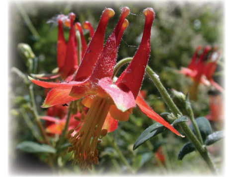
Western columbine— Aquilegia formosa

Hummingbirds feed by day on nectar from flowers, including annuals, perennials, trees, shrubs, and vines. Native nectar plants are listed in the table near the end of this guide. They feed while hovering or, if possible, while perched. They also eat insects, such as fruit-flies and gnats, and will consume tree sap, when it is available. They obtain tree sap from sap wells drilled in trees by sapsuckers and other hole-drilling birds and insects.