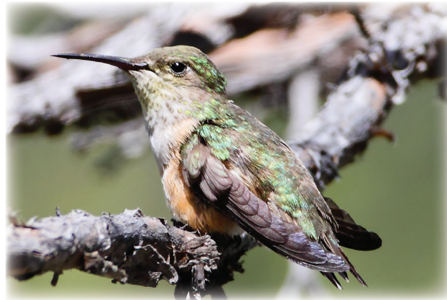
Calliope Hummingbird—female

NESTING —Preferred nesting habitat is montane conifer forests, primarily in shrub-sapling seral stage into second-growth following fires or logging, and usually near (within 1 mile) of riparian habitat. They breed mostly in mountain areas from British Columbia to California, Nevada, and Utah. They breed mainly at middle elevations (4,000 to 7,000 feet), but sometimes as high as timberline (above 9,000 feet) and down to lower forest margins (500 feet).