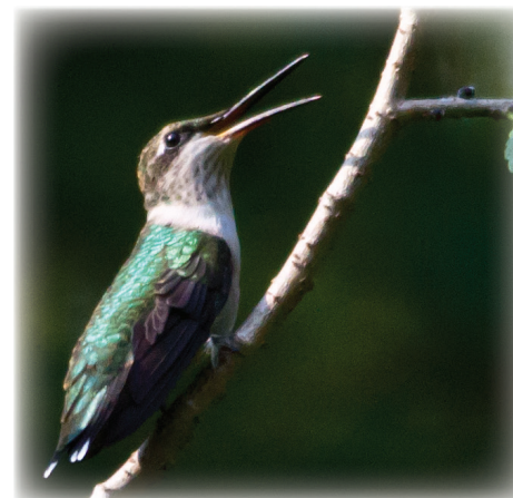
Ruby-throated Hummingbird—female

NESTING —Ruby-throats are birds of the edge; the female typically builds her nest near an open area on a downward-angled branch, sometimes overhanging water. They are far more common in hardwoods than in coniferous forests, from sea level to at least 6,000 feet in the Appalachian Mountains. Because of the density of green vegetation in the eastern U.S., Ruby-throated Hummingbird nests are