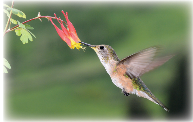
Broad-tailed Hummingbird—female

FOOD —Broad-tailed Hummingbirds primarily consume nectar from flowers such as red columbine, Indian paintbrush, sage species, currants, and scarlet mint. Broad-tailed Hummingbirds also feed from flowers that are not typically used by other hummingbirds, including pussywillows, and glacier lilies. They will