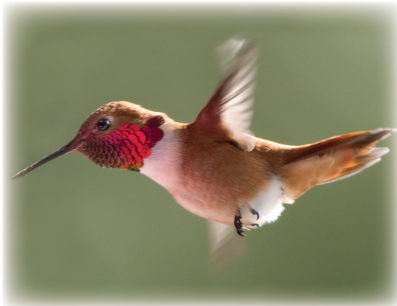
Rufous Hummingbird—male

NESTING —For breeding, they prefer second-growth forest, including clearcuts, burns and gaps. They will also use mature forests, parks, and residential areas— from sea level to 6,000 feet. Spring migration is mostly along the Pacific Flyway.