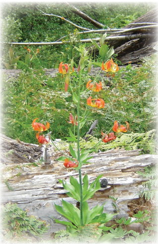
Wildflowers in meadow.

The hummingbird species of Idaho, Montana, and North Dakota are migratory, leaving in August to go to the wintering grounds in Mexico and returning to the US in April and May. Black-chinned, Calliope, Rufous and Broad-tailed hummingbirds breed in Idaho and Montana, while the Ruby-throated Hummingbird breeds in Eastern North Dakota. For hummingbird species to thrive, they need to find suitable habitat all along their migration routes, as well as in their breeding, nesting, and wintering areas. Even small habitat patches along their migratory path can be critical to the birds by providing places for rest and food to fuel their journey.