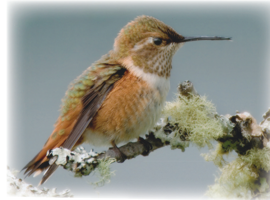
Rufous Hummingbird—female

RANGE —The Rufous Hummingbird travels farther north than any other hummingbird, wintering in Mexico and migrating to breeding sites as distant as Alaska. Although a relatively small hummingbird, it has an aggressive nature and frequently chases larger hummingbirds from nectar sources. It is an important pollinator in the cool, cloudy Pacific Northwest, where cold-blooded insect pollinators are at a disadvantage. They begin arriving in western Washington in March. East of the Cas-