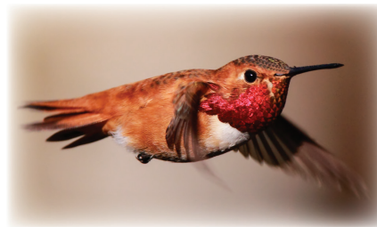
Rufous Hummingbird