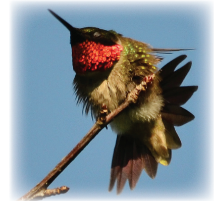
Ruby-throated Hummingbird—male

Although small numbers of ruby-throats historically overwintered in southern Florida and on the Gulf Coast, in recent winters they have become increasingly common northward to North Carolina's Outer Banks and, in some cases, even at inland locales in the southern U.S. (Most winter hummingbirds in the eastern U.S. are western species, especially Rufous Hummingbirds.) With their vast distribution across North and Central America, Ruby-throated Hummingbirds are arguably the most abundant of all 340-plus hummingbird species.