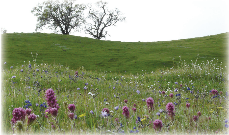
Hillside wildflowers.

ASC = Applewood Seed Co. BFI = BFI Native Seeds IGG = Idaho Grimm Growers Warehouse Corporation MM = Mountain Meadows Wildflower and Grass Seeds NI = Native Ideals Seed Company, LLC NSF = Native Seed Foundation