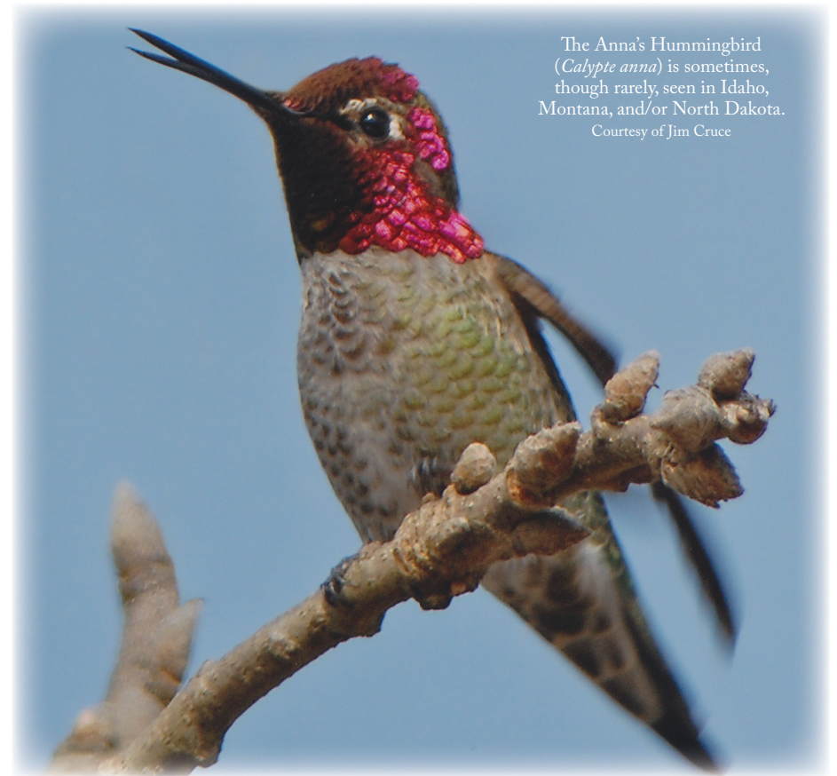
The Anna's Hummingbird ( Calypte anna) is sometimes, though rarely, seen in Idaho, Montana, and/or North Dakota.