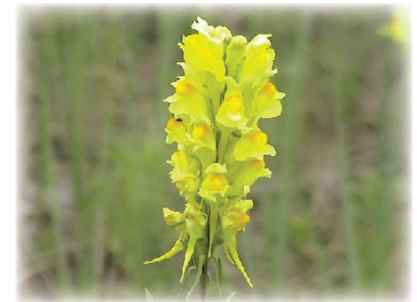
Yellow Toadflax

The following table ( Hummingbird Nectar Plants for Ecoregions in Idaho, Montana, and North Dakota ) lists some plants that are nectar sources for hummingbirds. These plants are native to Idaho, Montana, and/or North Dakota, and are adapted to conditions in the ecoregions indicated in the table. The table also provides basic information on habitat and light, soil, and water needs. Finally, the tables provide seed sources for each plant valid as of July 2015. A directory of the seed sources follows the tables. Use locally-adapted genetically appropriate plants in all your restoration and pollinator enhancement work. Seed zones—areas with genetically similar plants—help determine the right plant materials to use; poorly chosen plants usually fail to thrive. See http://fs.bioe.orst.edu/web_maps/S_Zones_1Oct2013.html for provisional seed zones of Idaho, Montana, and New Mexico, and select plant materials from your zone. Planting non-natives to attract hummingbirds is against policy and destructive: these plants become invasive and disrupt ecosystems. For example, yellow toadflax ( Linaria vulgaris , also called “butter and eggs”) is attractive to hummingbirds but is a noxious weed.