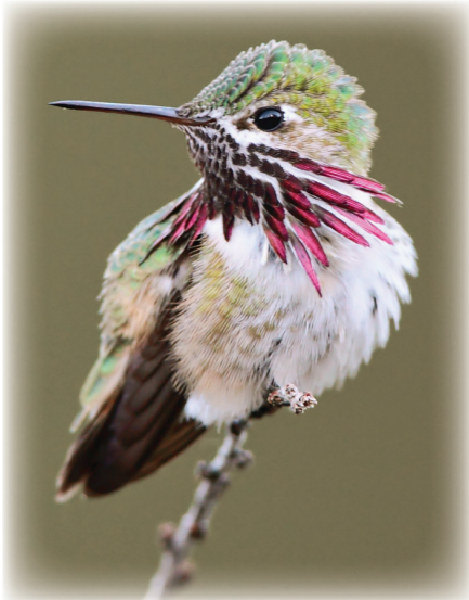
Calliope Hummingbird—male

RANGE —They are common summer residents in mountain habitats east of the Cascades crest. They migrate through both montane and lowland habitats. Spring migration is mainly through lower elevations along the Pacific Flyway. Fall migration is through both the Pacific and Rocky Mountain Flyways, at a wider range of elevations, from mountains to desert riparian corridors. The Calliope Hummingbird can be observed in the summer throughout mountainous parts of Idaho and western Montana, especially along riparian corridors such as rivers.