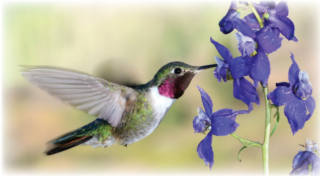
Broad-tailed Hummingbird—male

variety of mountain habitats including piñon-juniper, pine-oak, montane riparian areas and wet meadows, and areas of open mixed conifers including fir, spruce, and pine, typically at higher elevations than Black-chinned Hummingbird; these two species have only a narrow range of overlap around 6000 feet. The Broad-tailed Hummingbird occurs in BCRs 9 and 10 in Idaho and Montana, and is generally not found in North Dakota. It spends the summers breeding in southern Idaho and parts of western and southern Montana. It winters as far south as Guatemala.