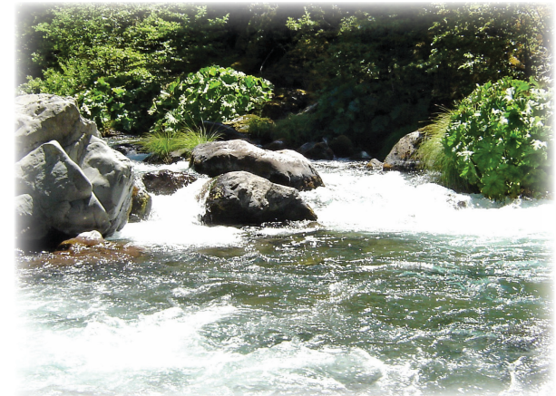
Mountain stream.

Hummingbirds get adequate water from the nectar and insects they consume. However, they are attracted to running water, such as a fountain, sprinkler, birdbath with a mister, or waterfall. In addition, insect populations are typically higher near ponds, streams, and wetland areas, so those areas are important food sources for hummingbirds.