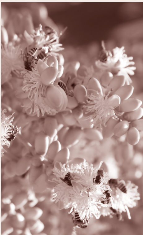
Hard working bees.