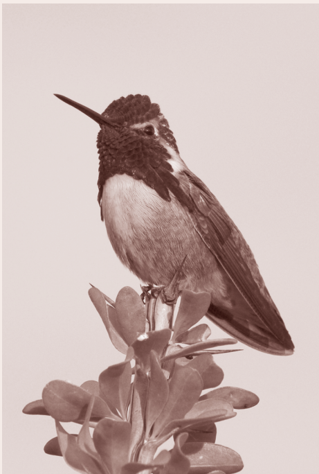
An adult male Costa's hummingbird sitting atop an ocotillo plant.