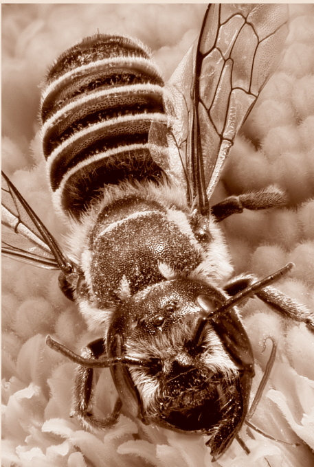
A female leafcutter bee on a sunflower.