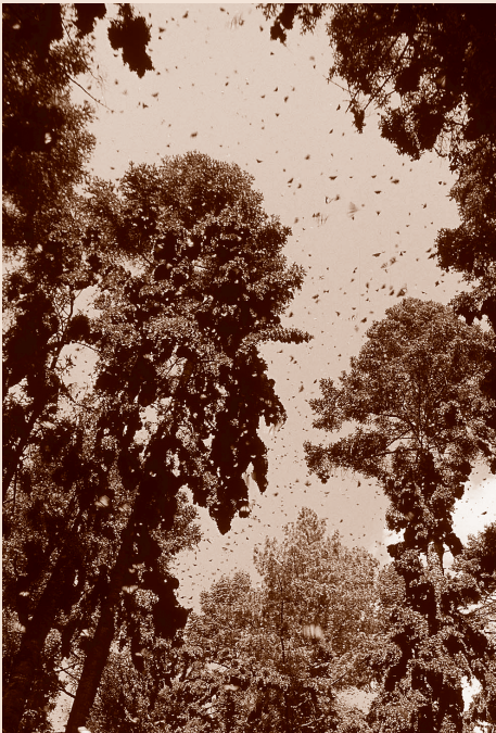
Monarch butterflies, long distance migrants.