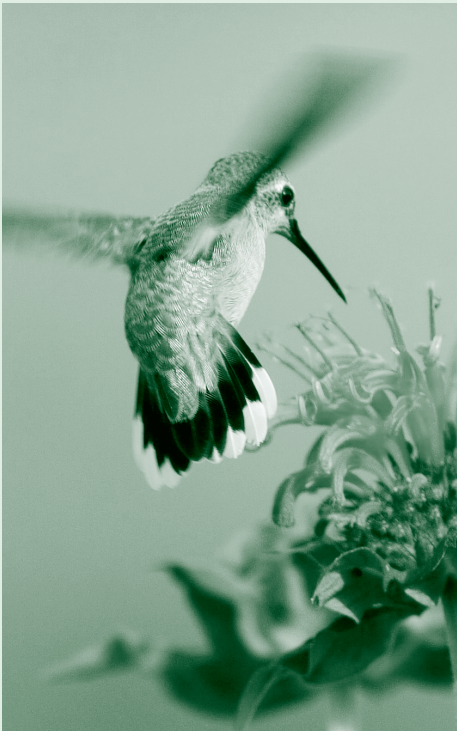
Female Calliope Hummingbird hovering & feeding on Bee-Balm flowers.