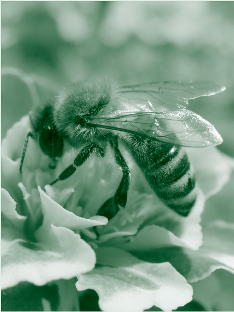
Bumble bee on flower.