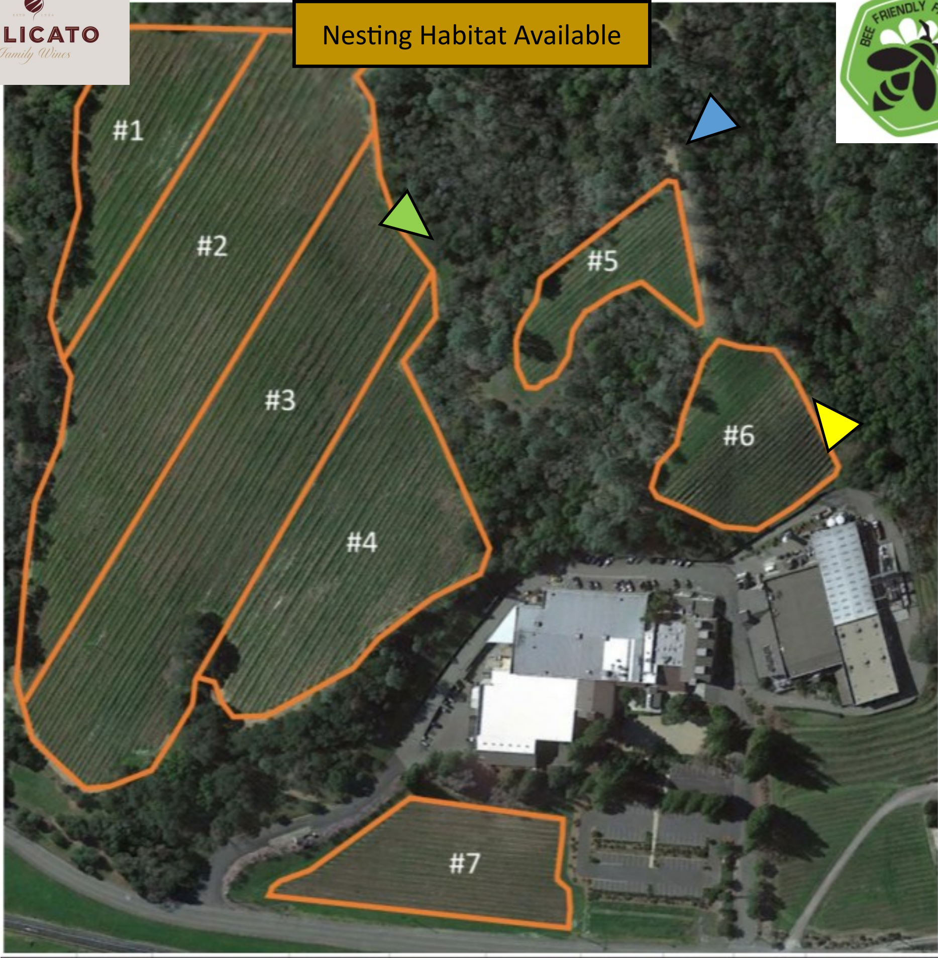
Woody debris pile