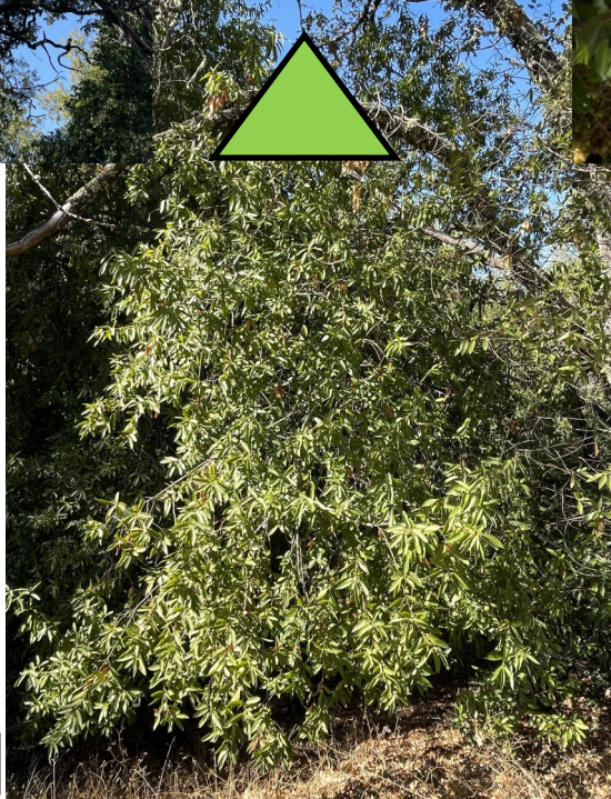
Calif. Bay Laurel