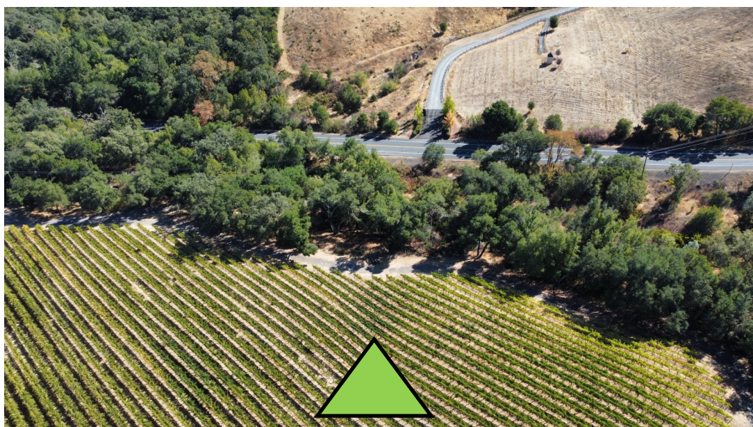
Seasonal Creek bordering south end of property