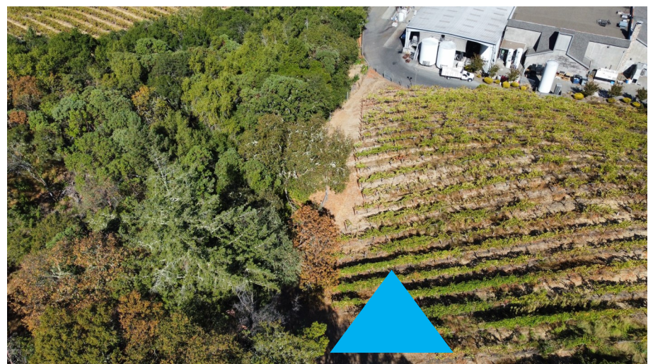
Seasonal Creek bordering north end of property