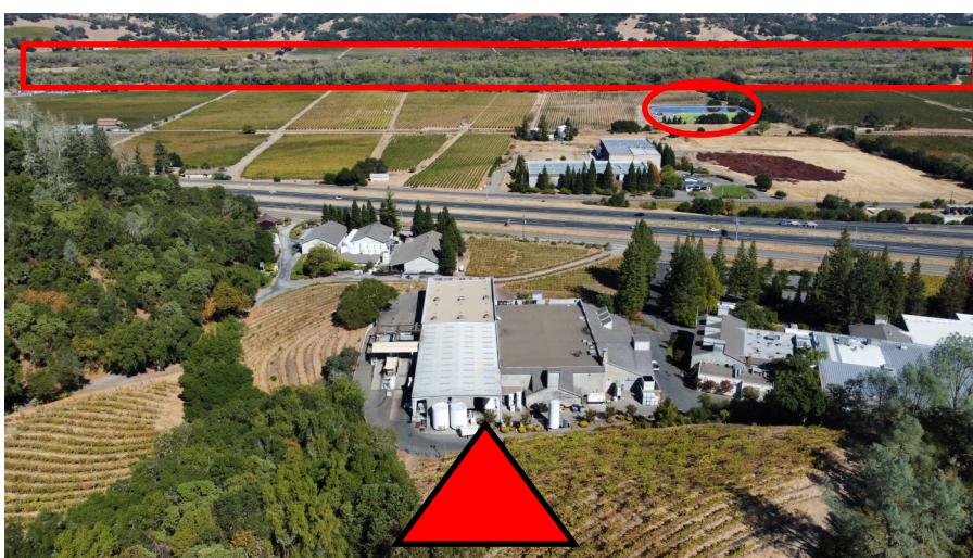
Ponds at our other facility and the Russian River within a mile of the property.