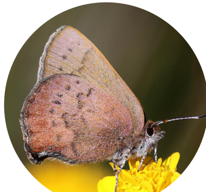
Butterfly and Moth Conservation