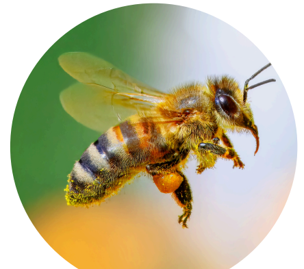
Honey Bee Health