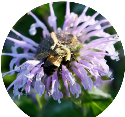
Imperiled Bumble Bee Conservation

$84,554 awarded to pollinator research grants