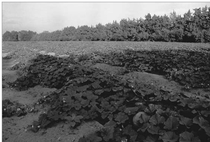
Windbreaks reduce wind speed and provide more favorable conditions for bee activity, which can increase crop pollination and yield.

Whether growing a hedgerow or windbreak, managing a riparian buffer, or farming near forests, agroforestry practices can increase the overall diversity of plants and physical structure in a landscape and, as a result, provide habitat for native pollinators. This is especially true if consideration is given to the specific habitat needs of bees when designing an agroforestry project. For example, a wide variety of flowering trees and shrubs can be incorporated into a hedgerow, or a diverse understory of insect-pollinated plants can be used to augment a riparian buffer. Planting specific trees for timber can also provide habitat for pollinators; black locust and maple, for example, supply abundant flowers and are excellent hardwoods that