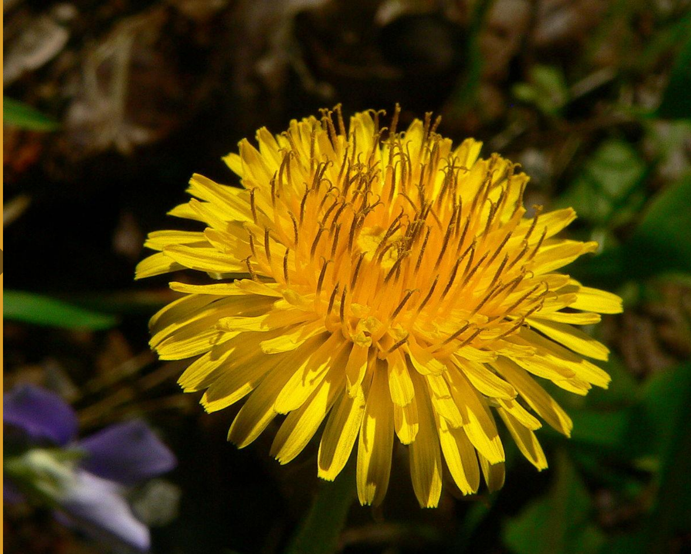
Doodooshaaboojiibik Dandelion ( Taraxacum officinale )