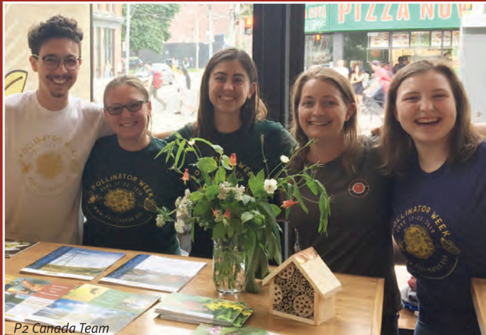
P2 Canada Team

ing Station in Niagara. P2C has gone from sea to shining sea with three new ecoregional guides for Nova Scotia and five for British Columbia!