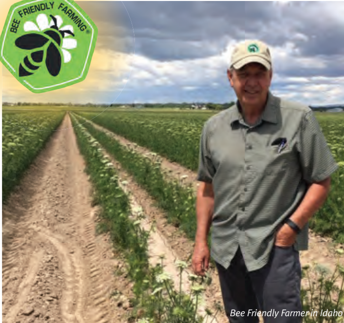
Bee Friendly Farmer in Idaho

BFFers will be updated on technical guidelines for on-farm habitat planting based on our EcoRegional Planting Guides. They’ll get updates to create the specific habitat these pollinators need through increased communication for all the BFF community, including farmer to farmer blog posts and a newsletter with specific tips for better farming that supports pollinators. Be sure to register your farm or garden in this expanding program.