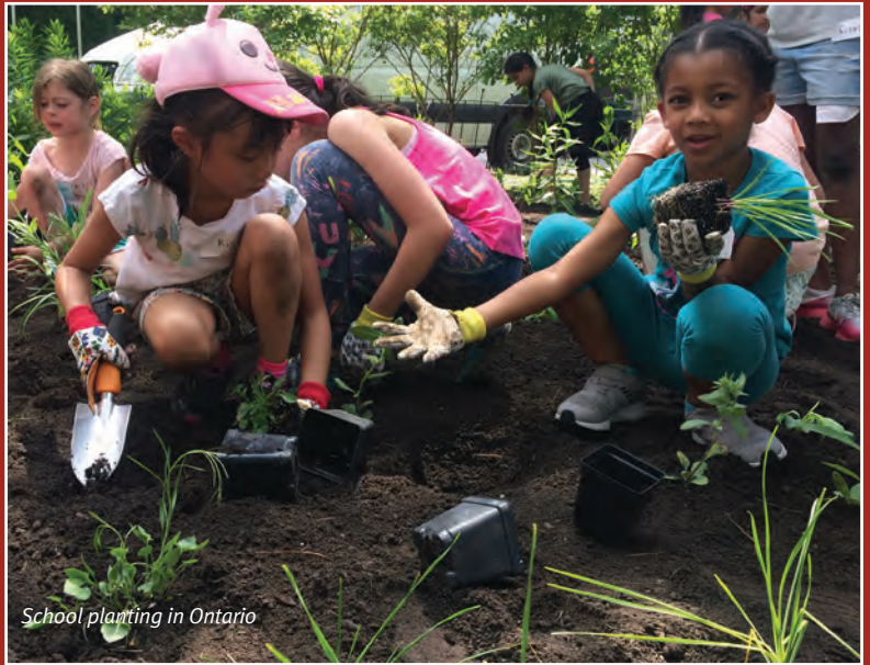
School planting in Ontario

2019 has been an exciting year of growth at Pollinator Partnership Canada (P2C) . Across Ontario, P2C successfully concluded a two-year project that saw the creation of 49 new monarch habitat sites, including school gardens, natural areas restorations, and 20 farms. The P2C team also conducted over 20 outreach events in Ontario and British Columbia, informing people about the importance of pollinators and ways to help them. In Ottawa, P2C presented case studies at the Canadian Wildlife Federation’s workshop on Pollinator Habitat Restoration on Rights-of-Way. Additionally, P2C has been working closely with Ontario Power Generation (OPG) to expand their pollinator program that includes habitat creation at several of their properties, including the Darlington Energy Complex Ranney Falls Generating Station and Sir Adam Beck Generat-