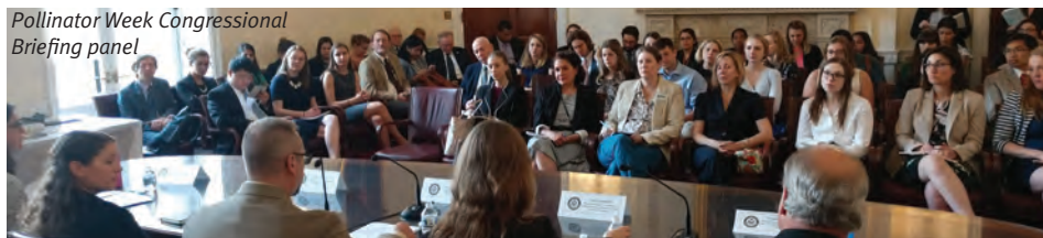
Pollinator Week Congressional Briefing panel