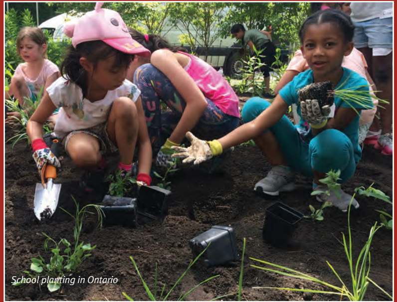
School planting in Ontario

2019 has been an exciting year of growth at Pollinator Partnership Canada (P2C) . Across Ontario, P2C successfully concluded a two-year project that saw the creation of 49 new monarch habitat sites, including school gardens, natural areas restorations, and 20 farms. The P2C team also conducted over 20 outreach events in Ontario and British Columbia, informing people about the importance of pollinators and ways to help them. In Ottawa, P2C presented case studies at the Canadian Wildlife Federation’s workshop on Pollinator Habitat Restoration on Rights-of-Way. Additionally, P2C has been working closely with Ontario Power Generation (OPG) to expand their pollinator program that includes habitat creation at several of their properties, including the Darlington Energy Complex Ranney Falls Generating Station and Sir Adam Beck Generat-