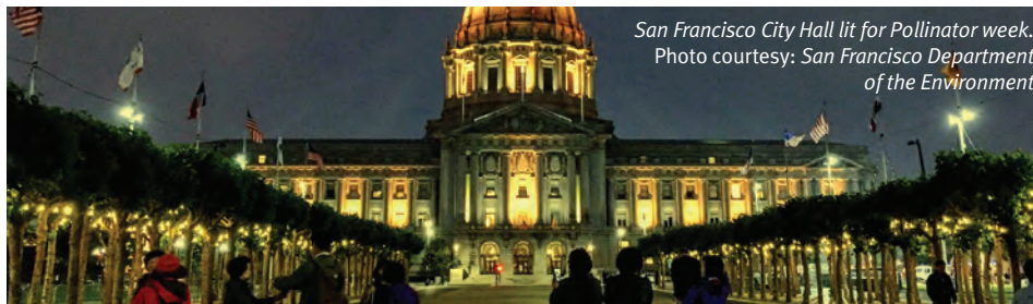
San Francisco City Hall lit for Pollinator week.

2019-07-29/bees-butterflies-and-your-well-being