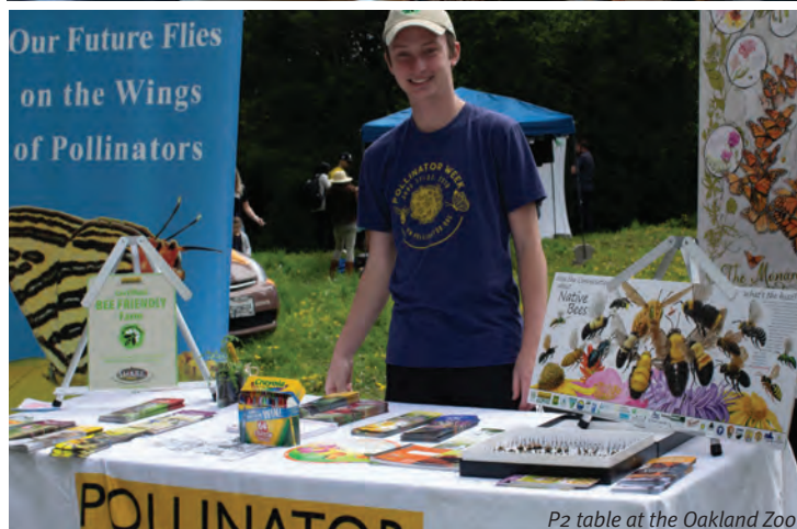
P2 table at the Oakland Zoo