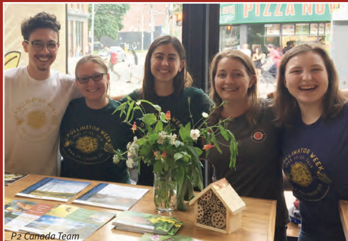
P2 Canada Team

ing Station in Niagara. P2C has gone from sea to shining sea with three new ecoregional guides for Nova Scotia and five for British Columbia!