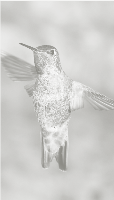
Anna's Hummingbird, a summer species in the Eastern Vancouver Island ecoregion.