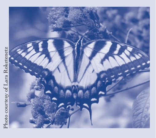
Eastern Tiger Swallowtail on Ironweed in Ohio.

Ruby-throated Hummingbird, a species frequently seen in the Eastern Broadleaf Forest.