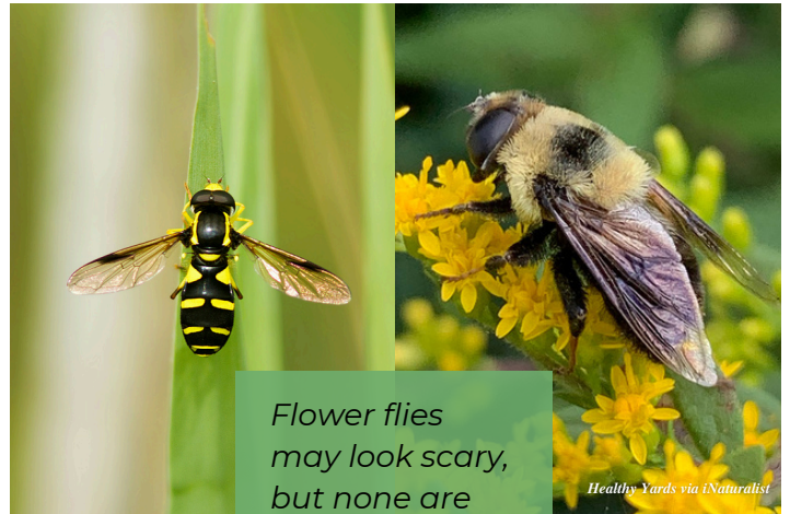
Flower flies may look scary, but none are capable of stinging!

Not only are flower flies great pollinators, but many species help control pests in agricultural and in home gardens. These larvae have a voracious appetite, each consuming up to 400 aphids during its development! Studies show that aphids released in greenhouses or in agricultural fields can nearly eliminate the present aphid populations without the use of pesticides.