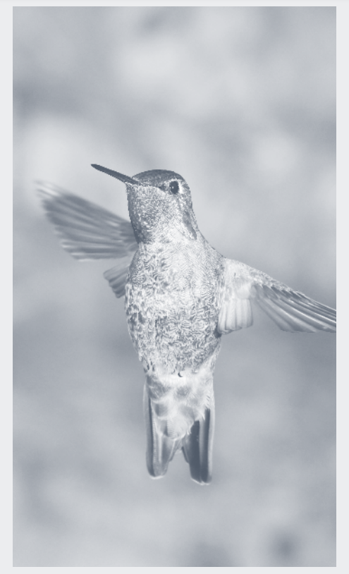
Anna's Hummingbird, a summer species in the Georgia-Puget Basin ecoregion.