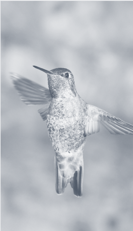
Anna's Hummingbird, a summer species in the Georgia-Puget Basin ecoregion.