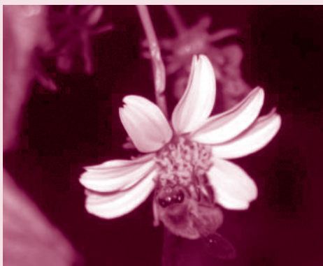
Wild honey bee on bidens sp.

“CONSERVE HAWAI’S UNIQUE NATIVE PLANTS BY INCLUDING THEM IN HOME LANDSCAPING. NATIVE PLANTS ADD BEAUTY, VARIETY AND FOOD SOURCES FOR NATIVE POLLINATORS AND HONEY BEES.”