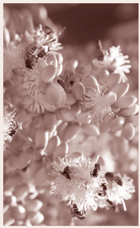
Hard working bees.

An adult male Costa's hummingbird sitting atop an ocotillo plant.