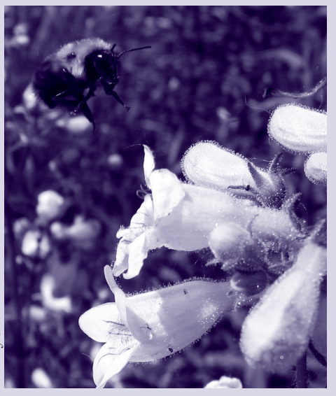
A bee visiting Penstemon digitalis.