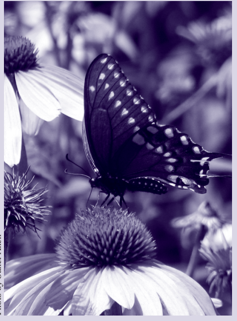
A Coneflower being pollinated by a Black Swallowtail.