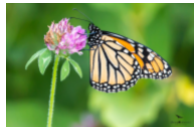
Monarch on Clover

program such as CRP or EQIP is not desirable, there are staff available to simply provide free technical assistance and advice to help you reach your goals. If you live in Ohio, Michigan, California, Wisconsin, Illinois, Indiana, or Arkansas, visit this link to find your local NRCS Liaison and we are happy to connect you with your local biologist. If you live in Ohio or Indiana, you can also contact your Pollinator Partnership Biologist directly.