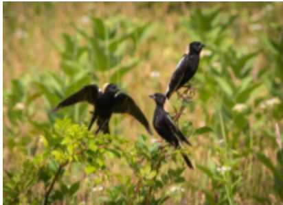
Male Bobolinks in the pasture area

I initially wanted to convert this entire 20-acre field to a diverse pollinator mixture but financially, the cost and time involved in site preparation and a diverse seed mix was not something I am able to tackle right now. So, focusing on naturally expanding from the