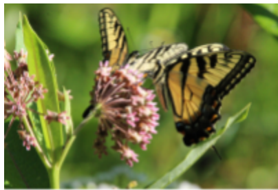
Tiger Swallowtails on Common Milkweed

When preparing for planting around my house, I needed to add some soil to the area to slope water away from the structure. We had an old dirt pile on the farm which was from the township road crew who dumped it when they were doing some work nearby. I added