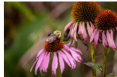
Bumble Bee on Purple Coneflower

only applied herbicide in the fall and did not use any other site preparation methods. I was worried about compaction being an issue but multiple freeze and thaw events that winter seemed to open up the soil and exposed plenty of bare ground for the seed. I broadcasted my previously collected seed mixture in January and was excited to see what would germinate in the summer. Unfortunately we ended up selling our house that spring and moving two hours east only to start over. However, this time we have a 2-acre yard and 100 acre family farm as a blank slate!