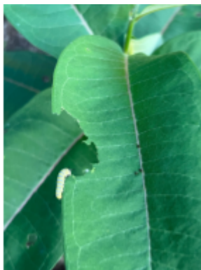
Monarch caterpillar eating some Common Milkweed

Big or small, your project has all the potential to make a difference for pollinators. There will be lots of trial and error and lots of successes as well. I had an area where many plugs did not survive being transplanted but I had one milkweed plant that did exceptionally well, and I ended up with 7 monarch caterpillars on that one plant. Even for the most experienced gardener, they are learning and noticing new things each growing season and that is a big reason why I enjoy planting natives so much. It provides many learning opportunities, from propagation techniques, plant and pollinator identification, transplanting, plant health, ecosystem services, and relationships within the environment. The more you