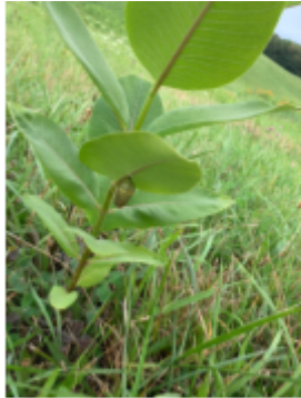
Monarch chrysalis on Common Milkweed

You don't have to be an expert to get into native plants and to create awesome habitat for wildlife and pollinators in your yard or surrounding marginal lands. A couple of years ago, I was happy mowing acres of lawn. That low cut, uniform looking lawn was appealing to me