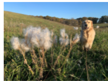
My Golden Retriever, Mallie happily posing with Butterfly Milkweed.

Your marginal lands may already be pollinator hotspots! We have a 20-acre hayfield in front of our house. It is pretty degraded as far as hay production goes and it is only cut once a year in early / mid July. We have many nesting meadowlarks, grasshopper sparrows, and bobolinks so we always try to time the mowing after fledging. Our field is mostly cool season grasses with primarily fescue, orchardgrass, and some timothy and bluegrass. But we also have some very large patches of butterfly milkweed, common milkweed, yarrow, goldenrod, ironweed, and a few clovers. In October/November, my dog, Mallie loves running through the milkweed patches as the pods are busting open. It always seems to be a pretty good seed dispersal event! After the seed is dispersed, I run over the areas with a cultipacker to try and make sure a lot of milkweed seed reaches the soil to help with establishment. It is amazing