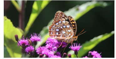
Fritillary species on Tall Ironweed

Below are a few additional pictures of pollinators using our landscape plants and milkweed patches in our field.