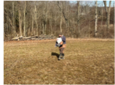
Broadcast seeding an area with Pollinator seed

harm to any pollinating insects. I had 3 sites that totaled just over 1 acre that I broadcast seeded in early February of this year on a brisk frosty morning. The mix contained about 5 species of native grasses and 30 species of native wildflowers. I am also positioning some brush piles and planting some shrubs nearby for additional habitat! In addition to the actual pollinator seeding, I am also trying to grow my own native plugs. I am now up to 27 species and 1,128 individual plugs that are currently stratifying. Many will be incorporated into our landscape, into the pollinator plots I have seeded, and some will be donated to local projects.