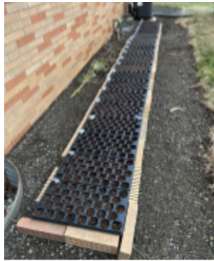
Some of the native plant species stratifying.

When we moved to our new home in May, I knew I had to start planning right away to convert some of the surrounding fescue pasture and yard into pollinator habitat for next summer. An old fescue pasture can be hard to work with since it has such an established seed bank. I began in July with doing some light tillage in my desired areas. Every 2-3 weeks when it would start to green up, I would till it again. On the final green up in October, I applied herbicide to kill the existing cool season grasses. A late fall herbicide is really effective on cool season grasses as the plants are trying to absorb everything they can to survive the winter. This results in fast absorption of the herbicide and a good kill. The herbicide was applied in the evening at low rates to limit