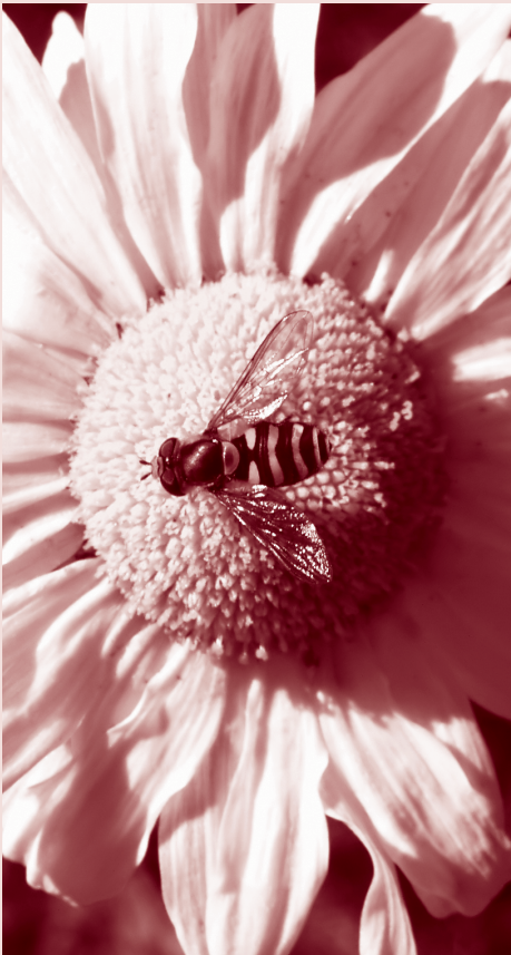
Flower flies, also known as hoverflies, mimic the appearance of bees or wasps and feed on nectar and pollen like bees, but are classified as flies.