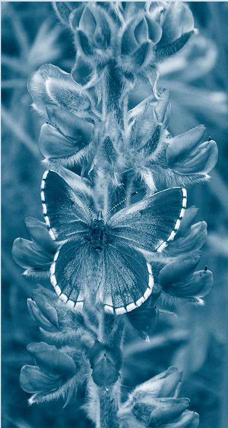
An arrowhead blue butterfly on lupine, a host plant in Idaho.