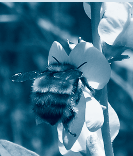
A bee foraging on a golden pea flower in Idaho.