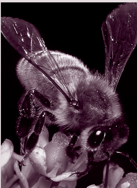
Tiger Swallowtail butterfly on Purple Hollyhock, (above), and a honey bee on a large holly bush in the Atlanta, Georgia area.