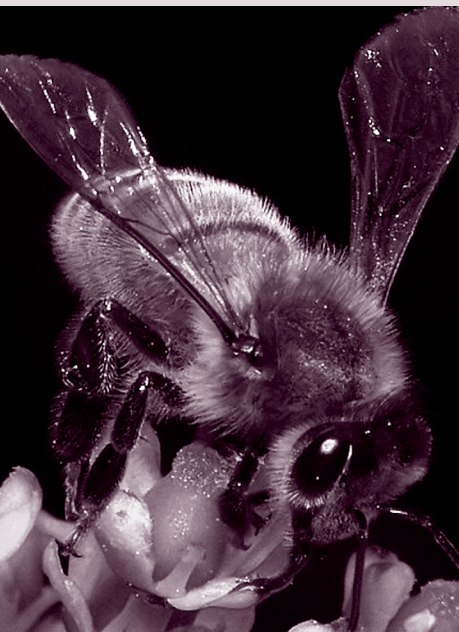
Tiger Swallowtail butterfly on Purple Hollyhock, (above), and a honey bee on a large holly bush in the Atlanta, Georgia area.