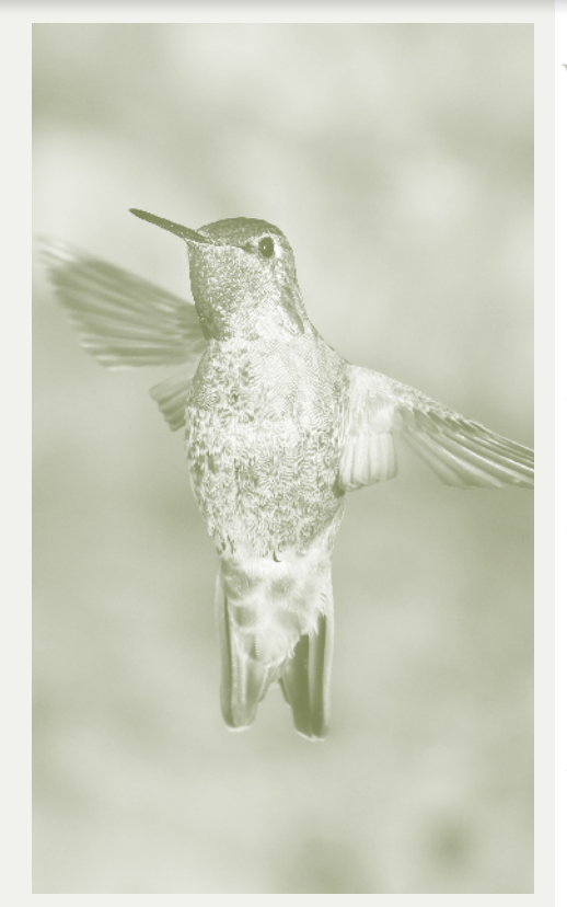
Anna's Hummingbird, a yearround species in the Pacific Ranges ecoregion.