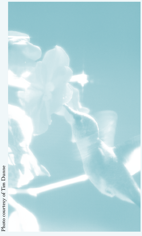
Ruby-throated Hummingbird, a summer species in the Prince Edward Island ecoregion.