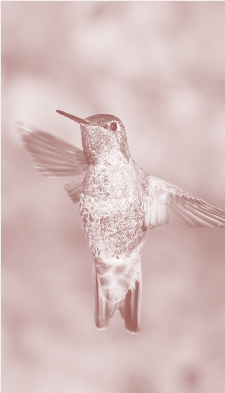
Anna's Hummingbird, a summer species in the Western Vancouver Island ecoregion.