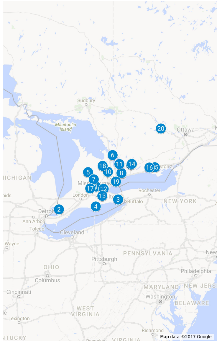
Native plant nurseries in Ontario that produce forbs (seeds or plant)