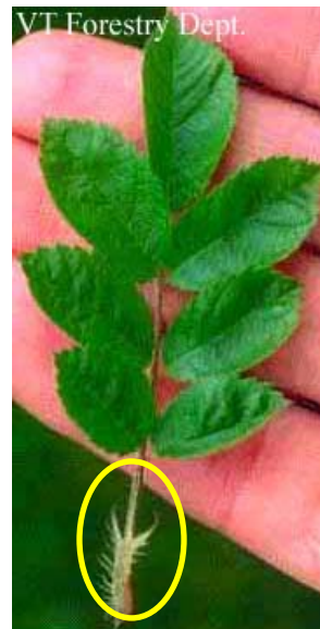
VT Forestry Dept.