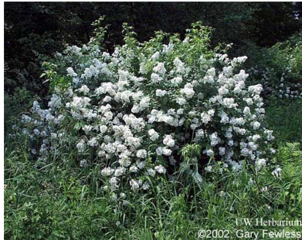
Multiflora rose in full bloom