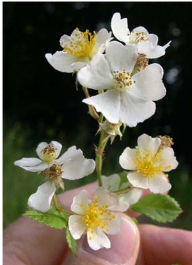
White flowers bloom in May-June

Habitat. It is found along stream banks, pastures, roadsides, savannas, forest edges and open woodlands. This plant thrives in sunny areas with well-drained soil but can tolerate a wide range of soil and environmental conditions. It is not found in extremely dry habitats or in standing water.