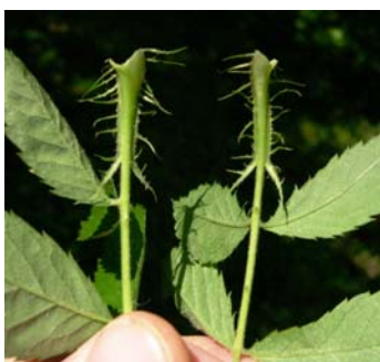
Base of leaf-stem is fringed.

Leaves. Multiflora rose leaves are alternate and compound