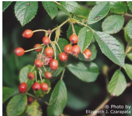
Small, hard fruits of multiflora rose