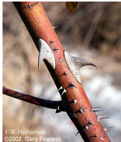
Branches have stiff, curved thorns